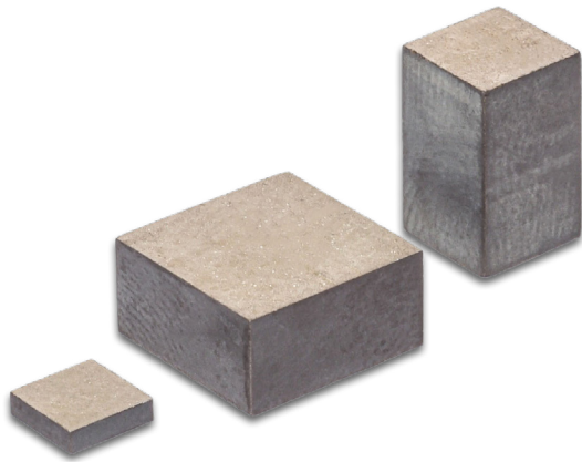
Piezoceramic plates of various sizes

Receivers for underwater imaging are usually fitted with piezoelectric components made of a PZT piezoceramic material with properties ranging from semi-soft ( NCE51 , Pz27 , 3195STD ) to soft ( NCE56 , Pz29 , 3203STD ). The components can have various shapes and sizes depending on the application, but the most common design is a simple plate. Large plates can be made into composites for increased sensitivity, while smaller plates can be assembled into arrays. CTS delivers single elements of piezoceramic blocks in sizes up to 150x100mm with uniform properties, but also offers dicing and upper-level assembly including arrays of sensitive piezo elements, ready for further integration.