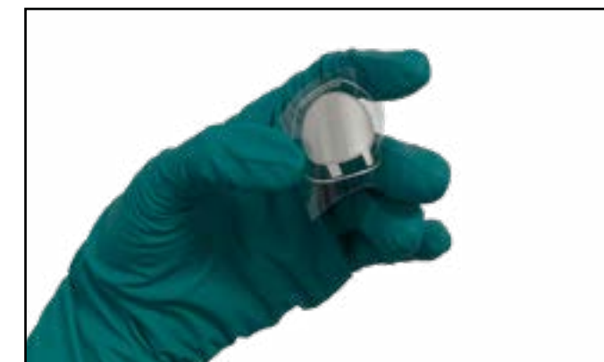
Flexible patch of PiezoPaint™ with electrodes

Studies as these provide a good indication of the potential medical applicability of PiezoPaint™, and of course, they are just a few of many possible utilizations. With its unique versatility, PiezoPaint™ could see use in various instances where a flexible link between mechanical and electrical energy is required.