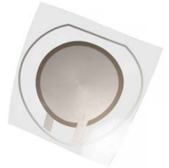
Electrode on PiezoPaint™ patch

PiezoPaint™ excels as a highly sensitive and broadly applicable alternative to PVDF materials, often used in combination with textiles and for large area deposition. PiezoPaint™ exhibits a significantly higher piezoelectric activity with a greater piezoelectric charge coefficient. It is also very easy to produce in large quantities. These features make it a very versatile material with the adaptability to serve in many and varied functions.